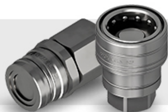
FLAT FACE FOR BRAKES APPLICATION ISO 5676 From DN10 to DN13 up to PN210

Below you can find two Quick Couplings from our range see the complete series here