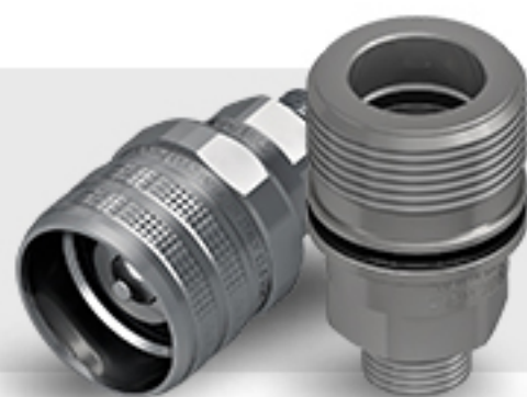
VGA ISO 14541 from DN6 up to DN25 up to PN420