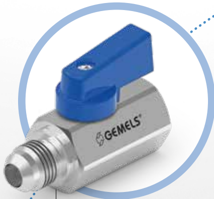
■ Ultra Compact Valve