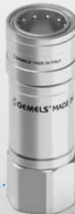
ULTRA FLOW QUICK COUPLINGS