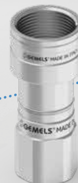
GNS QUICK COUPLINGS