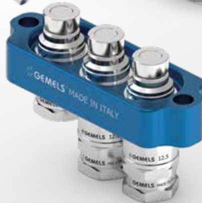
MULTI COUPLINGS MOUNTING PLATE