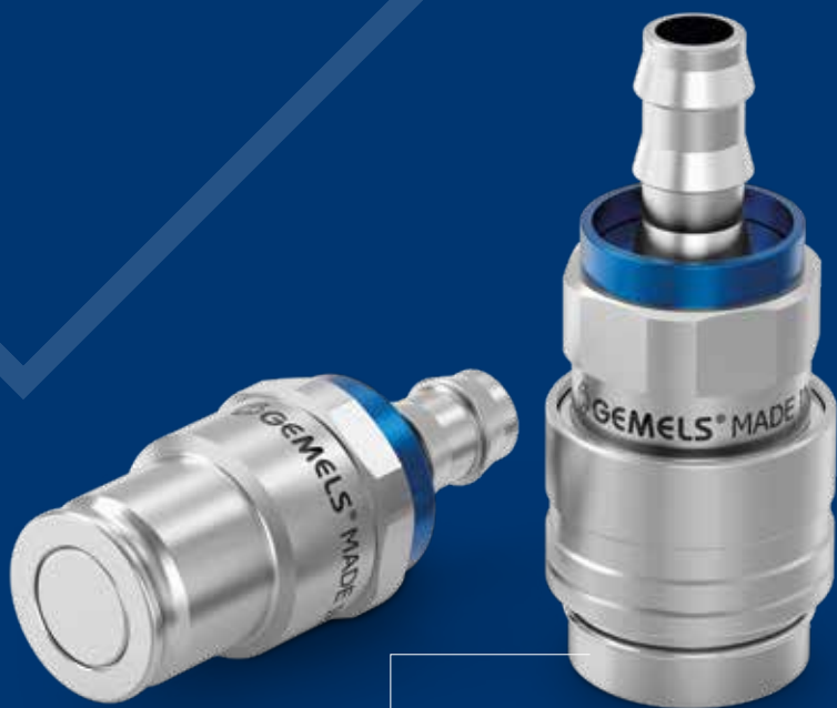
GNS QUICK COUPLINGS

GEMELS designs valves and quick couplings for data center cooling systems; with water and glicole water.